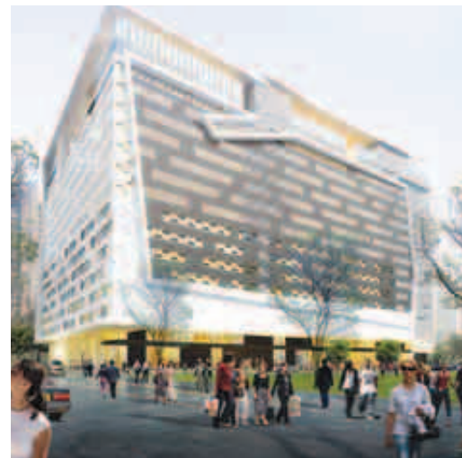
An artist's impression of Kenanga Wholesale City.