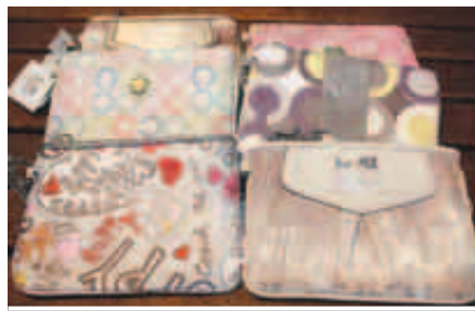
Coach wristlets in various designs.

Cannot get your mind off that Coach handbag you saw a few months back on a Coach boutique display? Stop trying to erase your memory of it and instead visit the www.welovecoach.com website and perhaps, make your dream bag come true.